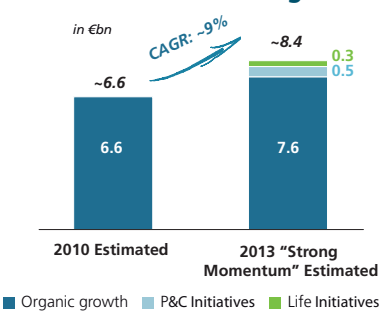
Chart 5 - SCOR group total estimated business growth

* TSR : Total Shareholder Return (share price appreciation + dividends paid)